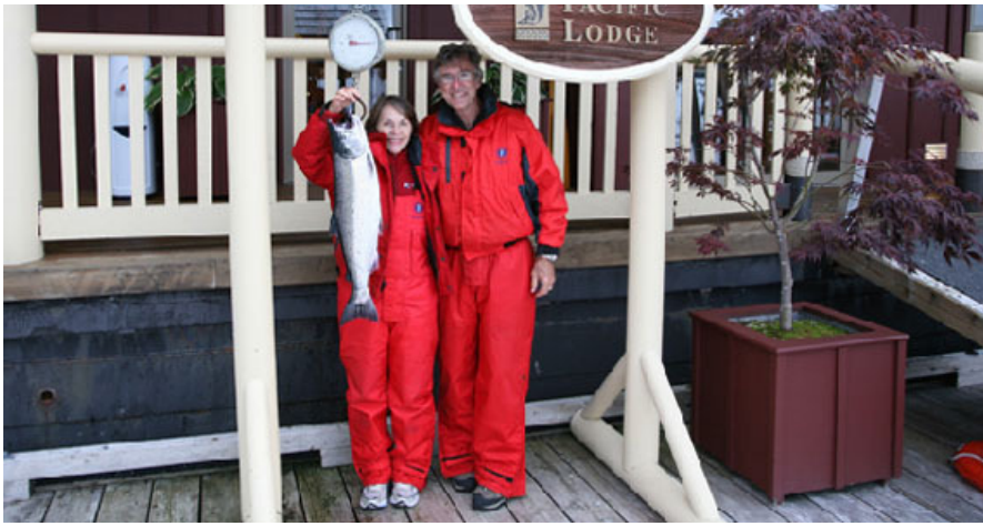
Even inexperienced fisher-people catch their limit at King Pacific Lodge