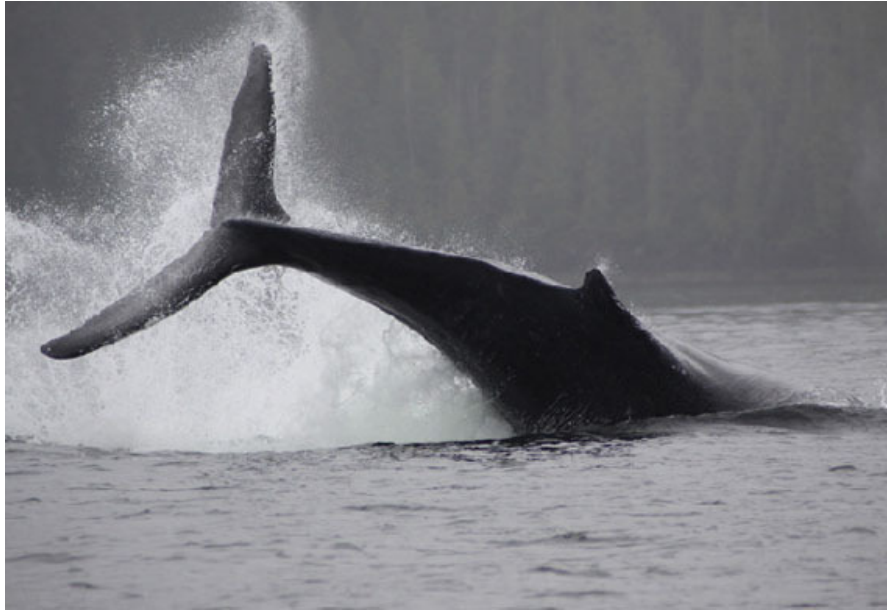
Any excursion from King Pacific Lodge can turn into a whale-watching spectacle

AntiGravity Yoga: Suspend and Tone, Learn to Fly! STEFANIE PAYNE »