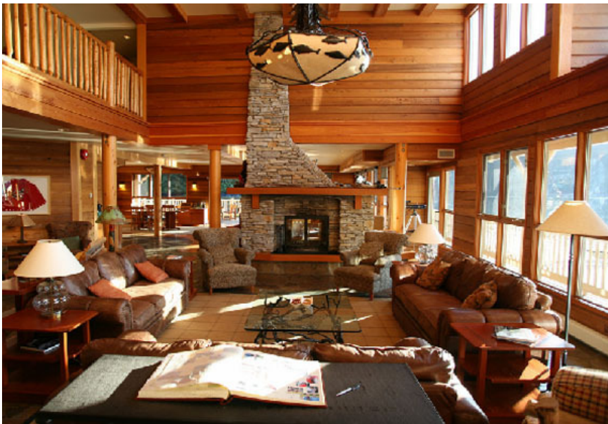
The cozy lobby lounge is a popular gathering place at King Pacific Lodge

Related Topics : King Pacific Lodge , British Columbia , Canada , Luxury Travel